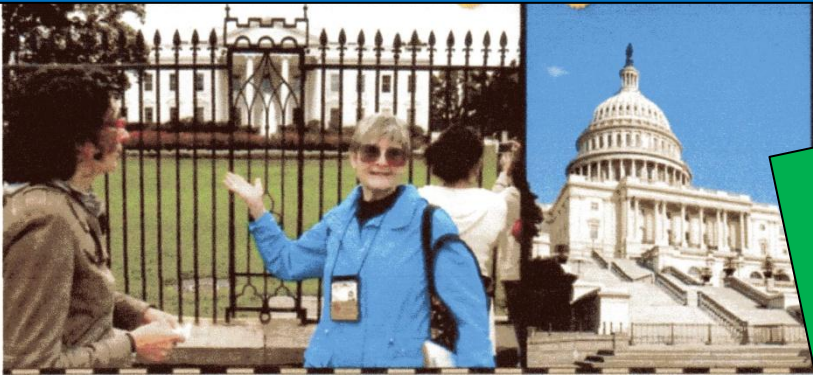
"Psssssssst! Auf den Spuren von Agenten durch Washington, der Hauptstadt der Geheimdienste" Süddeutsche Zeitung, Jan 19, 2006